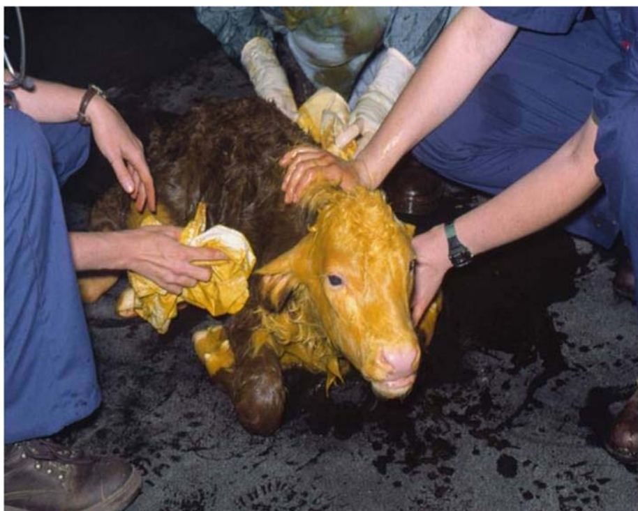
Figure 1: Meconium staining (yellow color) is an indicator of calf stress during delivery. Placing the calf on the sternum (as pictured) maximizes ventilation of the lungs.

reduce muscle tone and prevent shivering as well as decrease the calf's ability to utilize its brown fat. Calves with thermal stress and low energy are slow to stand and nurse, limiting their ability to warm themselves through this natural physical behavior. These calves should be exposed to an infrared heater or placed in a warm bath to improve rectal temperature, blood oxygen level, and respiratory rate. If electric heating pads are used, they must be closely monitored because pads can get hot enough to cause burns, particularly if the calf is unable to move off the pad. Heat lamps must also be monitored to prevent burns.