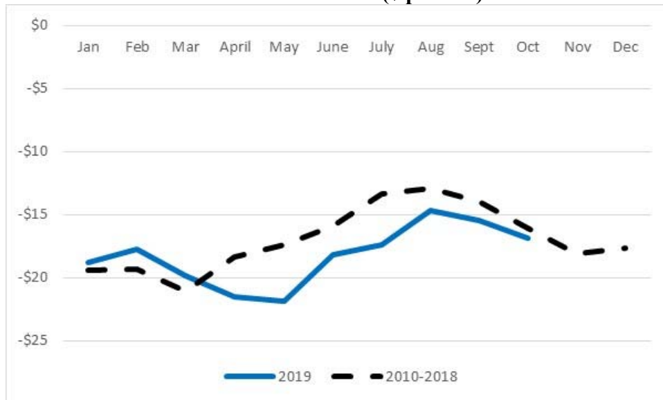
Figure 3. 550# Medium & Large Frame #1-2 Steer-Heifer Differential KY Auction Prices ($ per cwt)