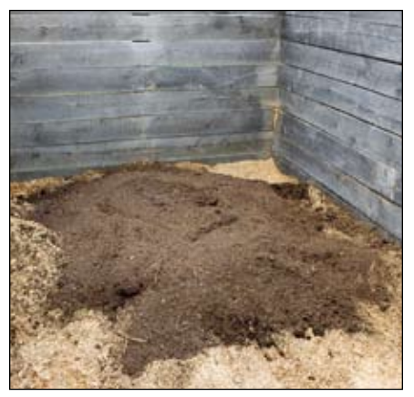
Figure 3. A layer of finished compost used as a blanket, providing a method to abate anaerobic gases.