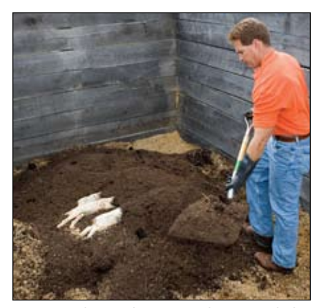
Figure 1. The two basic ingredients needed for composting animal mortalities are animal carcasses and bulking agent.

Optimum conditions are needed to keep the compost pile decomposing properly. The ideal C:N ratio for an initial pile is 30:1, with a range of 20:1 to 40:1 being acceptable. Other optimum conditions for composting include a temperature of 140° to 160°F, moisture content of 40 to 60 percent, 30 percent porosity, and a pH range of 6.0 to 8.0. Many of these optimum conditions require laboratory equipment and analyses or practical experience. However, there are indicators that can be used to determine optimum conditions.