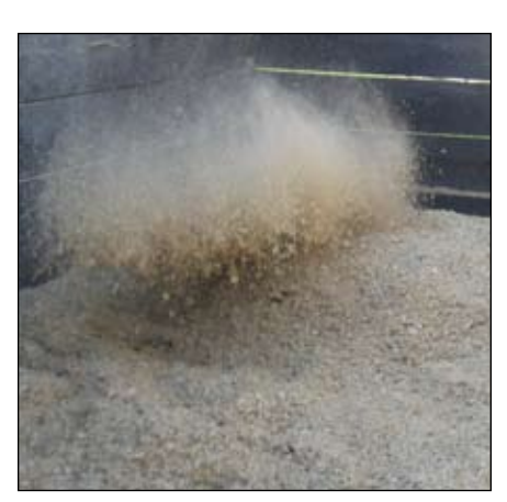
Figure 2. Wood chips being used as a bulking agent and carbon source.