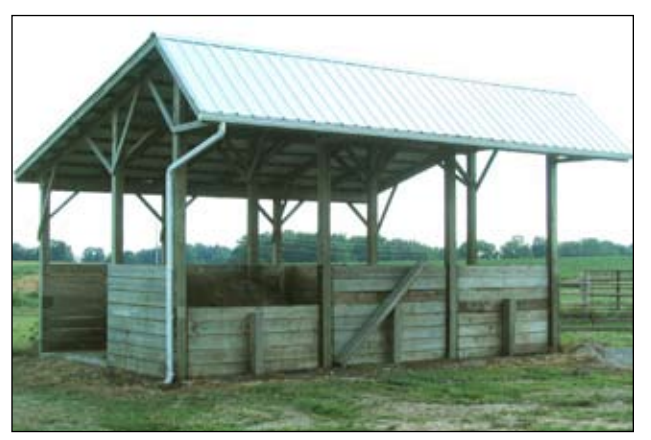
Figure 6. A three-bin shed with roof and doors.