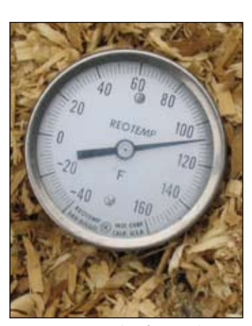
Figure 5. Example of an analog thermometer. Note that this pile needs to be heated up.