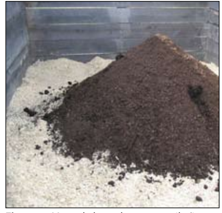
Figure 7. Mound-shaped compost pile (in the shape of a teepee or tent). This will allow rainwater to shed.

to an animal waste storage structure (earthen storage structure, lagoon, etc.). A disadvantage of an uncovered composting structure is that precipitation controls the composting process. Typically, in Kentucky, weather conditions in the winter and spring months provide too much moisture. High moisture causes air voids to be replaced with water. Combined with less optimum composting conditions, like decreasing temperature, the composting process begins to shut down, leading to anaerobic conditions and a putrid smell. This is why a roofed facility is one of the best to use when composting mortalities. You can always add water to a roofed composting operation.