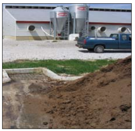
Figure 8. Mortality composting leachate entering drain to travel to existing lagoon.

The bin system is a structure that uses partitions to separate piles of compost. Typically, each bin represents a composting stage. Periodically, the bins are turned using a front-end loader or moved to a new bin for further breakdown or curing. Bin walls should be constructed of concrete or treated lumber. If a front-end loader is to be used for loading, turning, or unloading bins, then concrete push walls will retain their integrity longer than lumber. If lumber is to be used as a push wall, consider using bolts to fasten rather than nails. The width of the bin should allow easy access of loading equipment. Having an opening wide enough for manure spreaders provides the ability to use the spreader to distribute