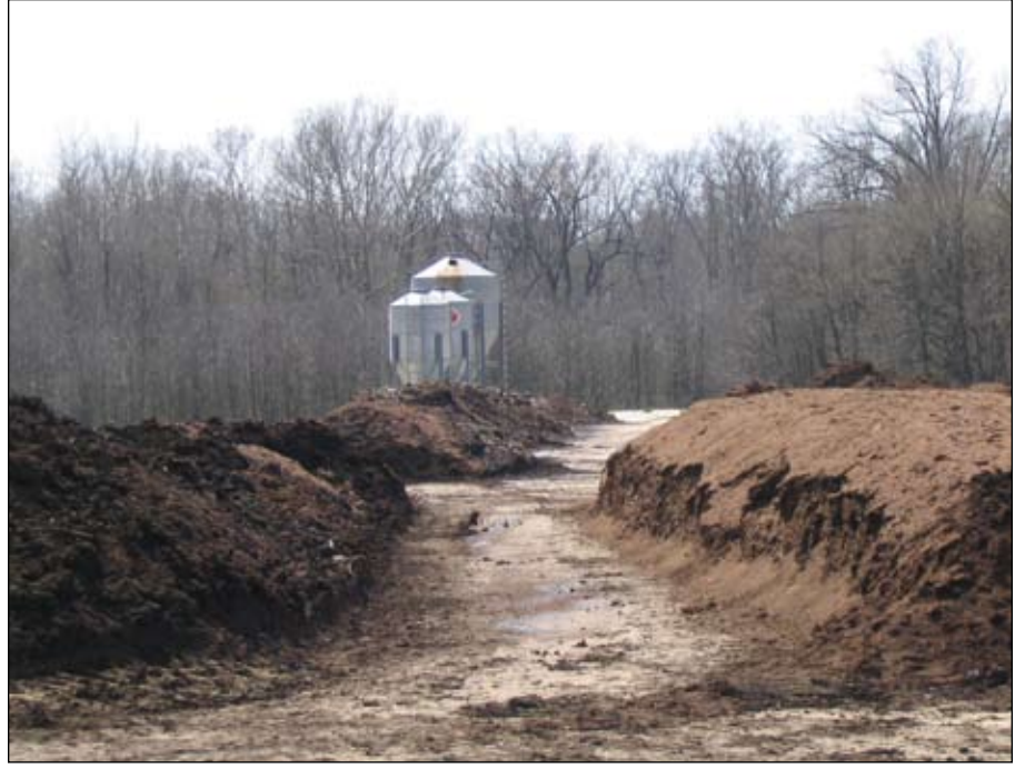
Figure 9. Compost mounds at varying stages of decomposition.