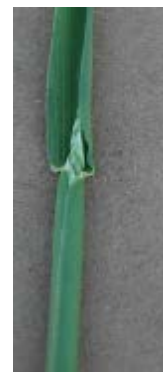
Figure 1. Late boot stage of maturity of a fescue plant. Notice that the seed head is just starting to emerge from the stem stat

Kentucky's spring weather is often times an enemy when trying to harvest quality forages. Spring rains can delay harvest. The key is to make the most of Kentucky's unpredictable weather. Starting a few days before the