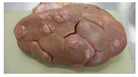
Lymphosarcoma in the kidney

How is BLV spread? Transmission of bovine leukemia virus is mainly horizontal from cow to