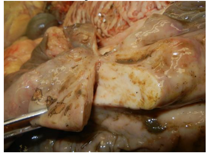
Multiple, firm white tumors may be present in any organ on postmortem examination. This tumor is lymphosarcoma in the abomasum.

inspection. A 2009 report sites malignant lymphosarcoma for 13.5% of beef cattle condemnations and 26.9% of dairy carcass condemnations. The bovine leukemia virus (BLV) initiates the cancer and this virus routinely spreads through contact with blood from an infected animal. BLV can spread through procedures such as injections with used needles, surgical castration and/or dehorning, tattooing, rectal palpation with dirty sleeves, as well as through insect vectors such as horseflies. Calves may also be exposed during pregnancy or while nursing an infected dam. Less than 2% of BLV-infected animals will go on to develop lymphosarcoma, a cancer affecting lymph nodes, multiple organs and white blood cells. Tumors may occur in the spinal canal, uterus, heart, abomasum, kidney and/or lymph nodes. The most common clinical signs include anorexia, weight loss and fever. Bovine leukosis is not transmissible to humans.