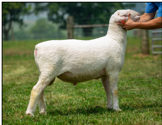
UK 22-2404

Performance data recorded on UK sheep are submitted to NSIP and the Estimated Breeding Values (EBVs) that are returned are used to select breeding sheep that will drive genetic change within each of the three flocks. Those EBVs also drive genetic change in the flocks of producers who buy breeding stock from UK. One such opportunity occurred July 28-29, 2023 at the Center of the Nation NSIP Sale in Spencer, IA. Over 200 head of premium breeding stock were sold to be part of “America’s Genetic Foundation for a Profitable Sheep Industry.” Four Polypay sheep from the UK flock were part of this sale. It was the first time since joining NSIP that UK sold breeding stock through this national sale. Polypay Ram UK 22-2412, shown in the accompanying