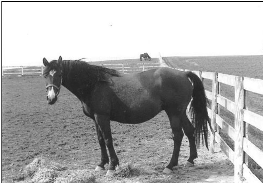
Mare in last 3 months of gestation.

*Hay fed free-choice in addition to grain