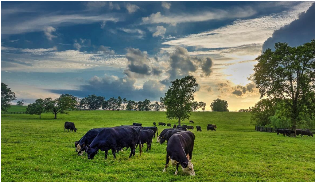
Figure 1 Tall fescue is the dominant grass of Kentucky, and most is infected with a toxic endophyte. Much is known about this unusual combination of pasture plant and internal fungus. Management, clover interseeding and replacement will improve livestock performance.

We now know the poor animal performance AND the persistence of that early fescue was due to the presence of a fungus inside the plant (the endophyte; 'endo' for in plus 'phyte' for plant). When the endophyte is present,