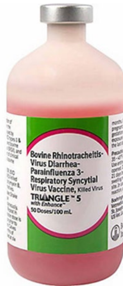
Figure 1: Examples of respiratory virus vaccines: Modified live or MLV (Bovi-Shield Gold 5/Zoetis); Killed (Triangle 5/Boehringer Ingelheim)