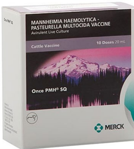
Figure 2: Examples of a combination MLV virus vaccine and "Pasteurella" (Vista Once SQ/Merck)-above and "Pasteurella" vaccine by itself (Once PMH SQ/Merck)-below.