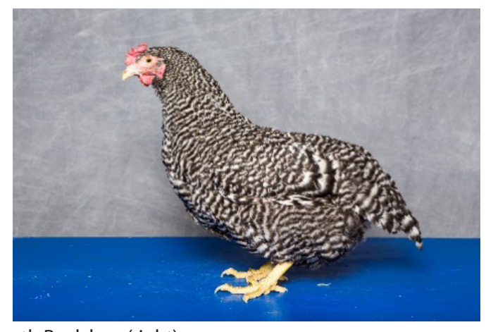
Figure 2. Rhode Island Red rooster (left) and Barred Plymouth Rock hen (right).