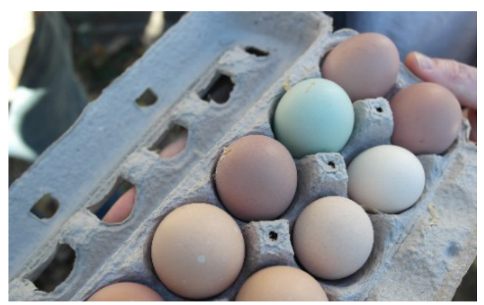
Figure 4. Eggs from a flock of different chicken breeds.

breeds. This was how the Ameraucana breed was produced (Figure 6) (when not up to the standards for the American Poultry Association, often referred to as an Easter-egger). Ameraucana hens lay a light blue, pink or green egg. Maran (Figure 7) hens lay a dark chocolate colored shell (Figure 8). Popular breeds for backyard flocks also include Silver-laced Wyandotte (Figure 9), Barred Plymouth Rock (Figure 10), Rhode Island Reds (Figure 11), and Buff Orpingtons (Figure 12).