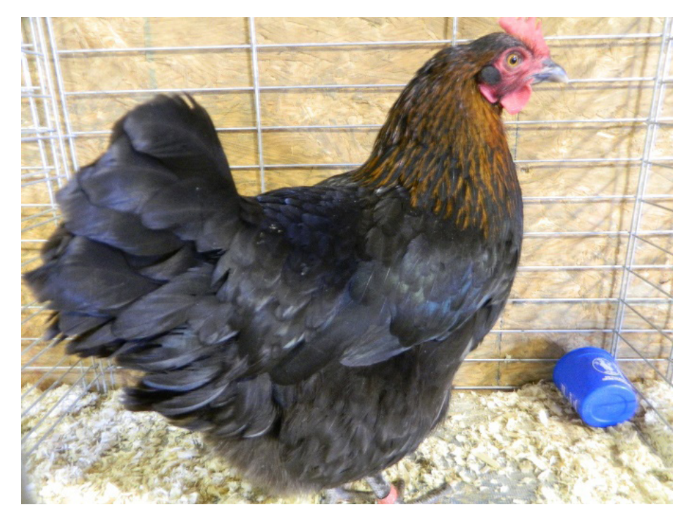
Figure 7. Maran hen.