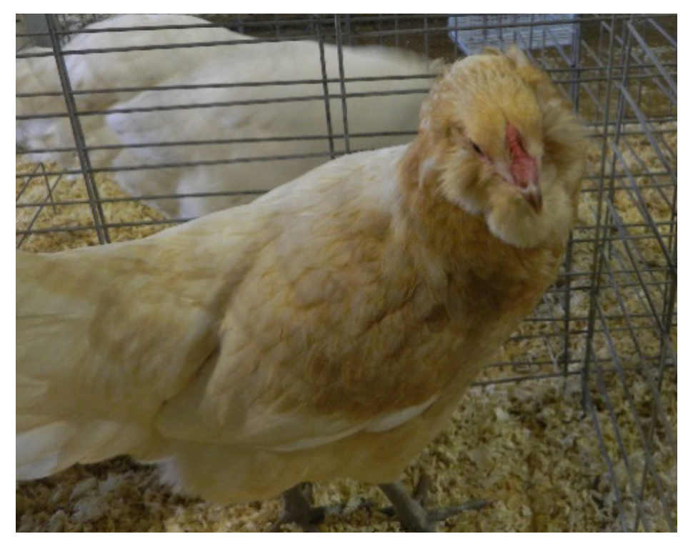
Figure 6. Ameraucana hen (with a tail and muffs and a beard rather than feather tufts).