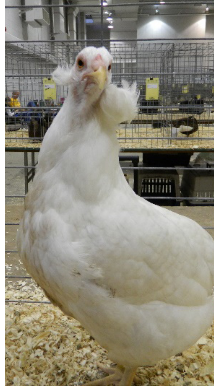
Figure 5. Araucana hen (rumpless and with tufts of feathers projecting from the face).

For whichever breed you select, it is important to source your flock from a hatchery participating in the National Poultry Improvement Plan (NPIP). If bringing the chickens in from out of state, it is required that the chickens come from an NPIP hatchery that is certified avian influenza clean.