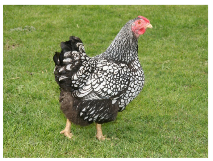
Figure 9. Silver-laced Wyandotte.