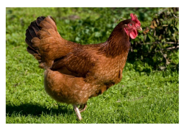
Figure 11. Rhode Island Red.