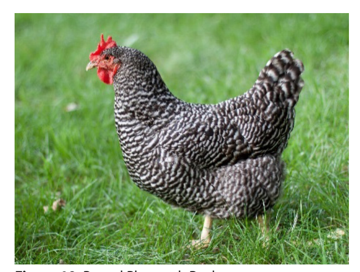
Figure 10. Barred Plymouth Rock.