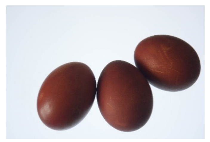
Figure 8. Dark brown eggs from the Maran breed