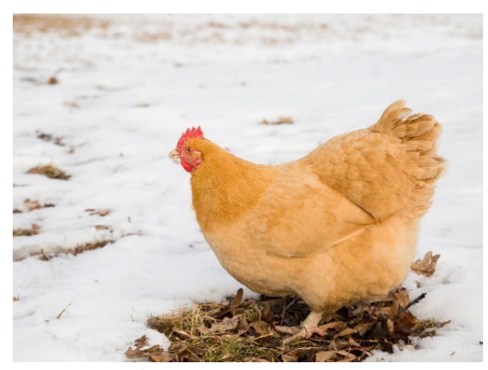
Figure 12. Buff Orpington.