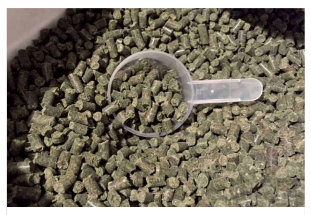
How to Choose Quality Nutritional Supplements for Your Horse

Use SMART supplementation strategies and the ACCLAIM system to find a quality product.