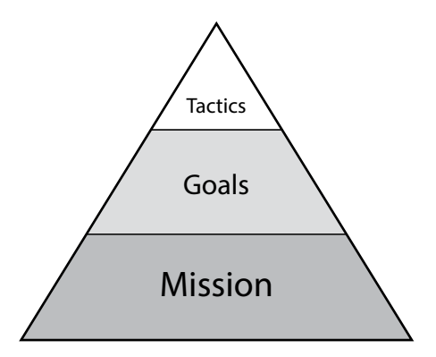
Figure 11-2. The planning pyramid.

Mission statements provide those involved in their creation with a vision of the future and a basis for strategic,