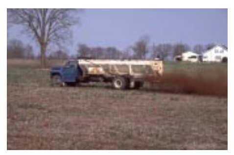
Apply animal manure when the crop can best use the nutrients it supplies.