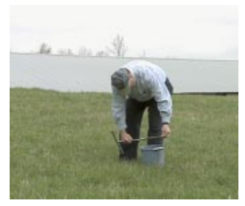
Soil testing is the foundation of a sound nutrient management program.