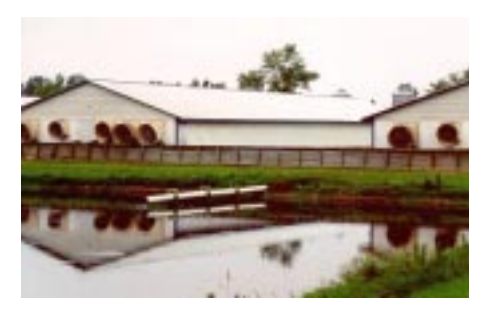
A lined earthen basin is an appropriate storage structure for liquid manure.