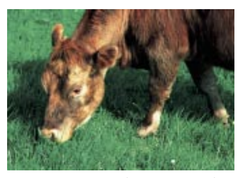
Nutrient cycling in pastures can be monitored by a good soil testing program (Photo courtesy of USDA NRCS).