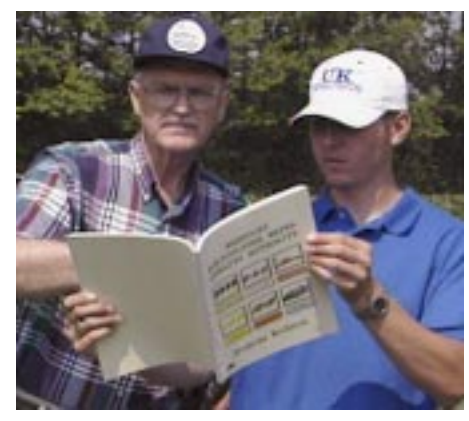
The Kentucky Agriculture Water Quality Act requires nutrient management plans on farms 10 acres or greater in size where nutrients are applied and/or utilized.

Grassed waterways are able to slow water and filter out contaminants. They are often combined with buffer strips or stabilization structures.