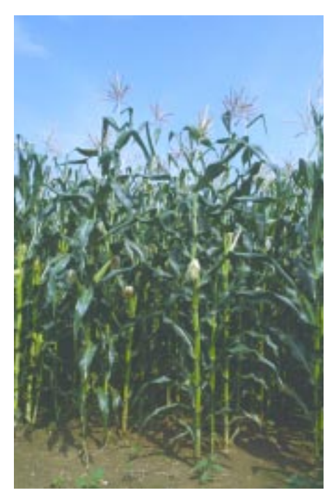
Spring is the best time to spread manure for a summer crop such as corn.

Manure should not be applied on frozen or snow-covered fields where subsequent rains could wash the manure off the field before it has a chance to move into the soil.