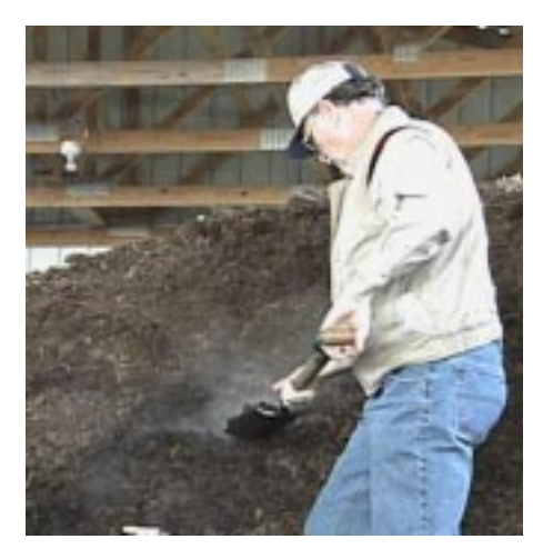
Sample manure as close to the time of land application as possible.