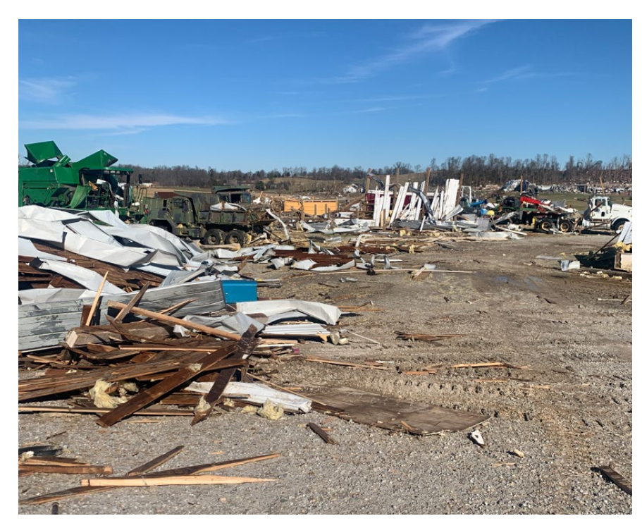
Damage to farm equipment, storage sheds, and one of the cattle handling facilities at the UKREC.

When securing animals on a storm-damaged operation, evaluating feed and water resources is also essential. It is possible that even if your operation only sustained minor damages, that impacts to surrounding areas could impact municipalities. It may be necessary to haul water to cattle. The storm may have affected feed resources, including hay, grain, and feeding equipment. People in the agricultural community are quick to jump in and help, so taking a few moments to determine your needs will allow others to assist you more efficiently. At the UKREC, we lost water and needed to have water trucked in for several days.