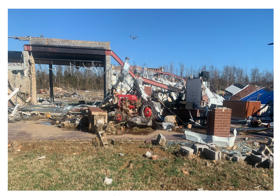
This Farmall Cub tractor was one of the original tractors used at the UKREC. It had previously been restored by the farm staff and was on display in the lobby of the UKREC and Grain and Forage Center of Excellence.

Cattle may also abort due to the stress of weather events. Pregnancy is a luxury; it is not necessary for survival. When cows experience stress, such as extreme weather events, biological processes kick in to help them survive (think fight or flight response). These processes affect every part of the body with the end goal of helping the cow survive. Thus, luxury processes such as pregnancy or even lactation can be negatively affected by stress. Keep a close eye on nursing calves in the days and weeks following storms, especially those whose dam may have been injured or killed due to the storms.