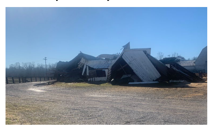
Damage to one of the barns at the UKREC beef unit

The University of Kentucky Research and Education Center in Princeton, KY, suffered catastrophic