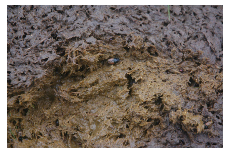
Figure 3. Nitrogen fixed by legumes is shared indirectly with grasses through grazing and subsequent deposition of dung and urine. In this photo dung beetle is hard at work breaking down a cow patty.

Always inoculate or use pre-inoculated seed. Since legumes fix nitrogen from the air by forming a symbiotic relationship with Rhizobium bacteria, inoculating seed with the proper strain of nitrogen fixing bacteria prior to planting is the best way to ensure optimal fixation.