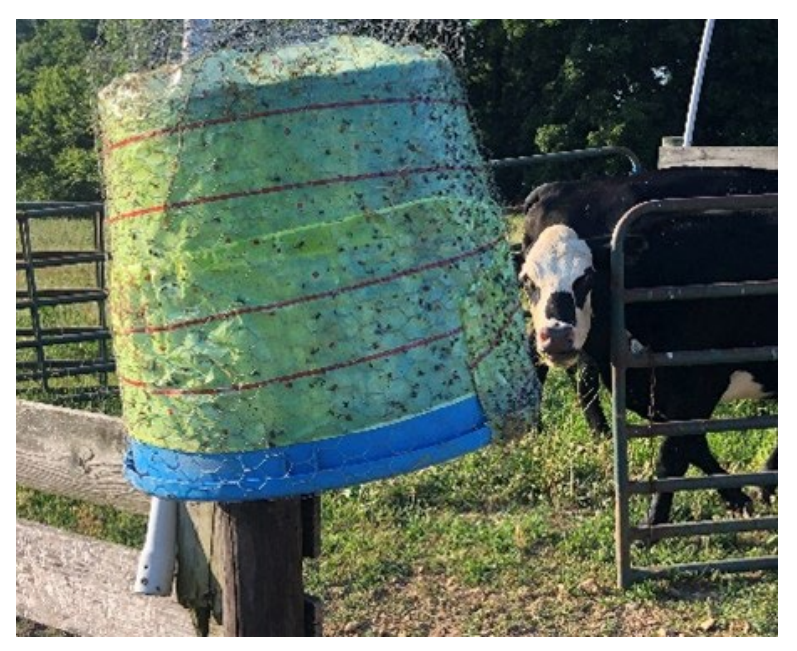
Figure 4: Fly trap made with fly paper wrapped around a protein tub with chicken wire, placed near water and mineral sites.

decrease development of resistance and, most importantly, rotate fly tags to a different mode of action (MOA) each year (see Figure 3).