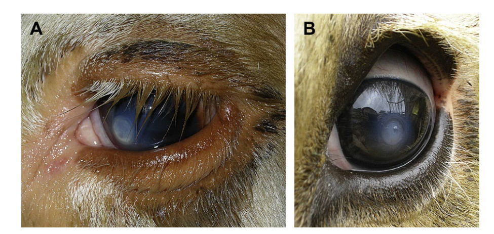
Figure 4 : Corneal ulceration in the early stages of pinkeye.

from affected eyes within a certain area. To make a vaccine, all samples for bacterial culture must be taken early in the course of disease; preferably when the eye is just beginning to tear excessively and before any medications are used. These autogenous vaccine formulations, especially those that include M. bovoculi antigens, often show beneficial results in the field. Autogenous vaccines do