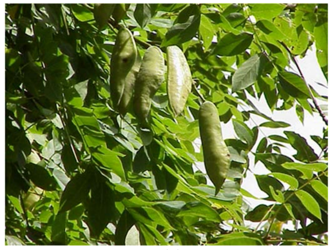
Kentucky Coffee Tree-Accessed 8/3/2018 http://www.wcisel.com/plants/kentuckycoffeetree/coffee_tree-04622.jpg

Oaks ( Quercus spp.) contain gallotannins that cause inflammation within the digestive tract and directly damage the kidneys. Acorns (especially green), young shoots, leaves, sprouts, and fall buds all contain tannins but content varies with oak species and with leaf age. Cases of natural oak tannin toxicosis have been reported when feed is scarce and animals eat large amounts of oak shrubs, leaves, or acorns usually over several days. This causes irritation to the digestive tract and increased absorption of the toxin into the bloodstream. When blood runs through the kidney, the toxin destroys the kidney tissue. Cattle will go off feed but are often excessively thirsty and urinate frequently. The urine may be brown-colored or dark early on but will usually return to clear. Initially cattle are constipated followed by loose/sometimes bloody diarrhea that is frequently described as black and tarry. Often cattle will grind their teeth and hunch up due to abdominal pain then death