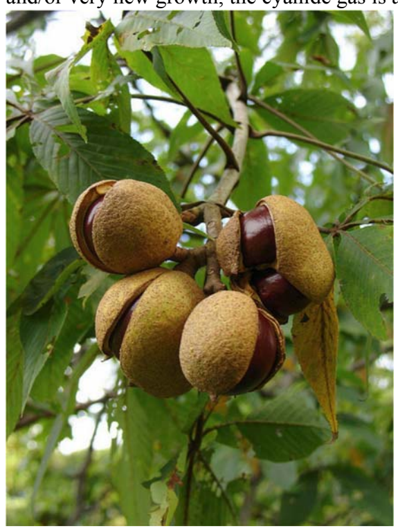
Buckeye Fruits

Two common toxicities in Kentucky resulting in sudden death in cattle are consumption of wilted wild cherry tree leaves and consumption of hedge trimmings from Japanese Yew, although the mechanisms causing death are quite different. Cherry tree leaves contain both cyanogenic glycosides and the enzymes needed to convert the glycosides to free cyanide gas but these components are isolated away from each other within the plant cells. When cherry tree leaves are damaged (wilted, chewed, crushed, frozen), the cyanogenic glycosides and the enzymes can physically come together and rapidly form free cyanide. When cattle consume wilted leaves and/or very new growth, the cyanide gas is absorbed directly from the rumen into the bloodstream where it