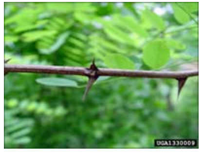
Black Locust Tree- Accessed 8/3/2018 from https://www.extension.iastate.edu/forestry/iowa_trees/trees/black_locust.html

Black Locust ( Robinia pseudoacacia ) are all potential causes of poisoning in livestock. All cause irritation to the digestive tract initially so signs may include slobbering and diarrhea, bloat, abdominal pain, and possible regurgitation of rumen contents. If severe intoxication, will see labored breathing, weakness, collapse and death. Mountain Laurel and Rhododendron (both members of the Heath family) contain grayanotoxins in all plant parts,