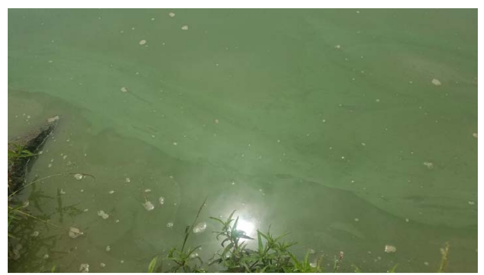
Figure 1: Pond in Scott County

Are all algal blooms poisonous to cattle? Of the more than 2000 species of blue-green algae identified, at least 80 are known to produce toxins (poisons) that can affect animals and humans (see Table 1 for the most