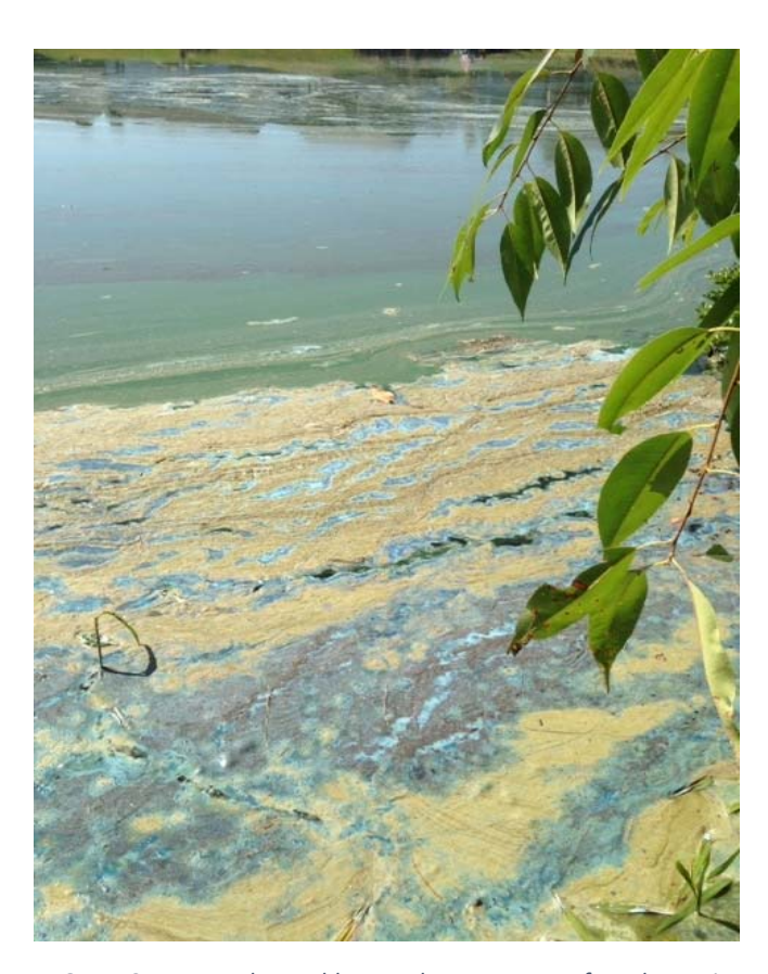
Grant County Anabaena bloom.