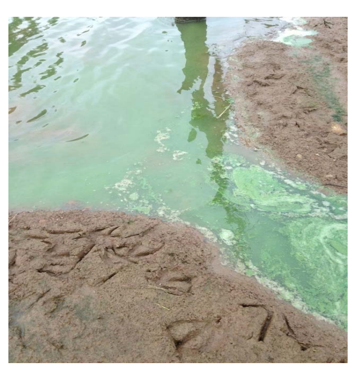
Livestock pond in Scott County: Planktothrix-Anabaena bloom.