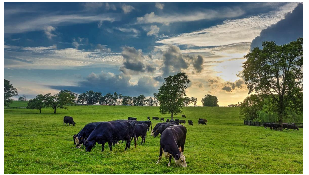
Figure 1 Tall fescue is the dominant grass of Kentucky, and most is infected with a toxic endophyte. Much is known about this unusual combination of pasture plant and internal fungus. Management, clover interseeding and replacement will improve livestock performance.

We now know the poor animal performance AND the persistence of that early fescue was due to the presence of a fungus inside the plant (the endophyte; 'endo' for in plus 'phyte' for plant). When the endophyte is present,