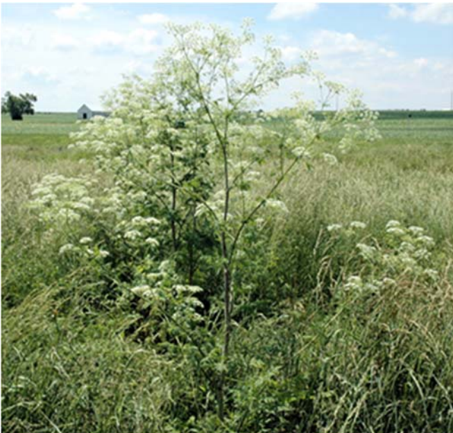
square stems and serrated produce small, white to

produces many seeds and large colonies can develop in succeeding years.