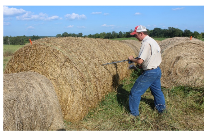
Figure 1. Always use a hay probe to sample bales. Round bales should be sampled from the sides and square

Sample hay in lots. Hay should ALWAYS be sampled in lots. A lot consists of hay made from the same field and cutting. A lot should not represent more than 200 tons of dry matter. In the event that a lot exceeds 200 tons of dry matter,