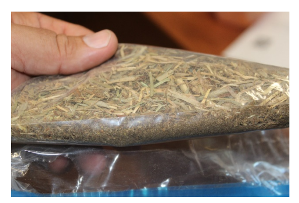
Figure 3. Never subdivide a sample before submitting it to the lab. Core samples are made up of both large and small particles that can segregate making it difficult to get a representative subsample. In this photo the fine particles have move to the bottom of the bag.

Do NOT submit excessively large samples. Forage testing labs will subdivide samples. They will NOT grind entire sample. This can significantly impact test results. The sample submitted should be no larger than one-half pound.