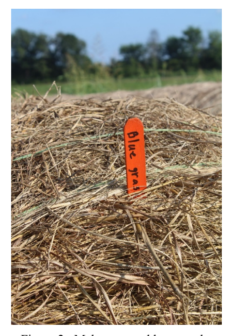
Figure 2. Make sure and keep track of where different hay lots are located. This can be accomplished by labeling where lots start and stop and drawing maps. This best done when hay is moved from the field to its storage location. This will help with sampling later.

Early sampling also allows you to better plan how and when certain lots of hay should be fed. For example, if you have a hay lot (one field-one cutting) that is very high in quality (cut early and cured well) then it could be fed when the nutritional requirements of the animal are the highest. Likewise, identifying hay lots that have marginal nutritive value early, will allow you plenty of time to plan appropriate supplementation strategies.