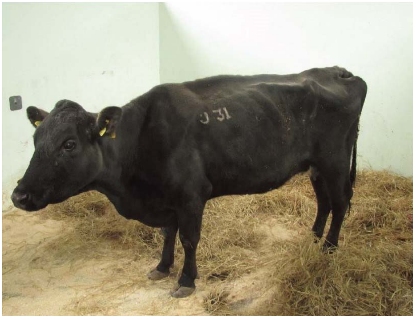
Figure 1: Recently calved cow with signs of Johne’s disease; dull hair coat, profuse watery diarrhea and weight loss. Photo from “Management and Control of Johne’s Disease in Beef Sucker Herds” by Drs. Isabelle Truysers and Amy Jennings. In Practice July/August 2016/Volume 38, page 348.

intestinal lining to slowly thicken. With time, the thickened intestine loses the ability to absorb nutrients, resulting in watery diarrhea. There is no blood or mucus in the feces and no straining. The clinical signs of diarrhea and extreme weight loss in spite of having a good appetite, do not show up until 2-5 years of age or even older. There is no treatment available and the animal eventually dies due to starvation and dehydration. The MAP organism is “shed” in the feces before diarrhea starts and continues until the animal’s death. Map bacteria are very hardy due to a protective cell wall that allows survival for long periods (potentially years)