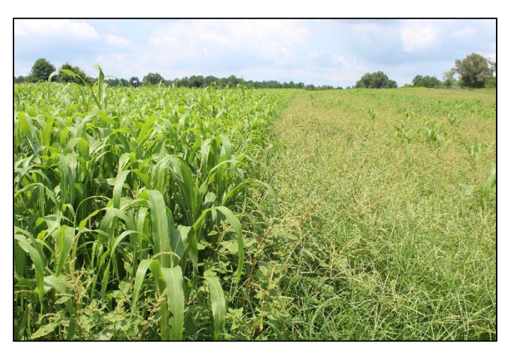
Figure 2. Sorghum-sudangrass (left) formed a quick canopy that was able to shade out summer annual weeds compared with a mixture of forage soybeans and pearl millet (right).

areas include sudangrass, sorghum-sudangrass, pearl millet, and crabgrass. Detailed information on the adaptability, establishment, and management of these species can be found in