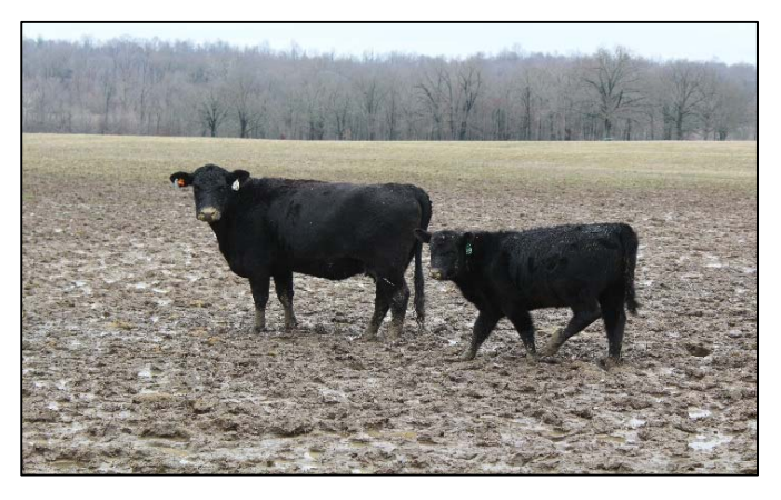
Figure 1. Excessive rainfall and high livestock concentration in and around hay feeding areas has resulted in almost complete disturbance.

Wet conditions this winter have resulted in almost complete disturbance in and around hay feeding areas. Even well-designed hay feeding pads will have significant damage surrounding the pad where animals enter and leave. These highly disturbed areas create perfect growing conditions for summer annual weeds like spiny pigweed and cockle bur. Their growth is stimulated be lack of competition from a healthy and vigorous sod and the high fertility from the concentrated area of dung, urine and rotting hay. The objective of this article is to outline approached for dealing with these areas.