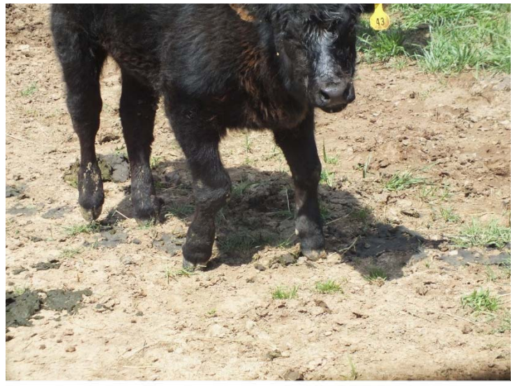
Figure 1: Calf with "joint ill" affecting the right front carpus (knee). Bacteria from the bloodstream localize in the joints and cause arthritis. This condition often occurs in calves born in unsanitary conditions with delayed or inadequate colostrum intake.

With Coronavirus in the headlines, this is an excellent time to review what biosecurity is and why it is important in cattle operations. "Infectious agents" that cause disease, whether they are viruses, bacteria, or parasites, are spread primarily through physical contact, inhalation of aerosolized droplets, or they can be consumed in contaminated feed or water. These organisms can be carried into the environment by other infected animals, including wildlife or vermin, by insect vectors, or they can be found on dirty clothing, boots, vehicles, or equipment. "Biosecurity" simply means reducing the risk of disease by minimizing exposure to infectious agents. Biosecurity measures are not limited to keeping disease-causing organisms off the farm but also preventing disease from exposure to organisms already on the farm.