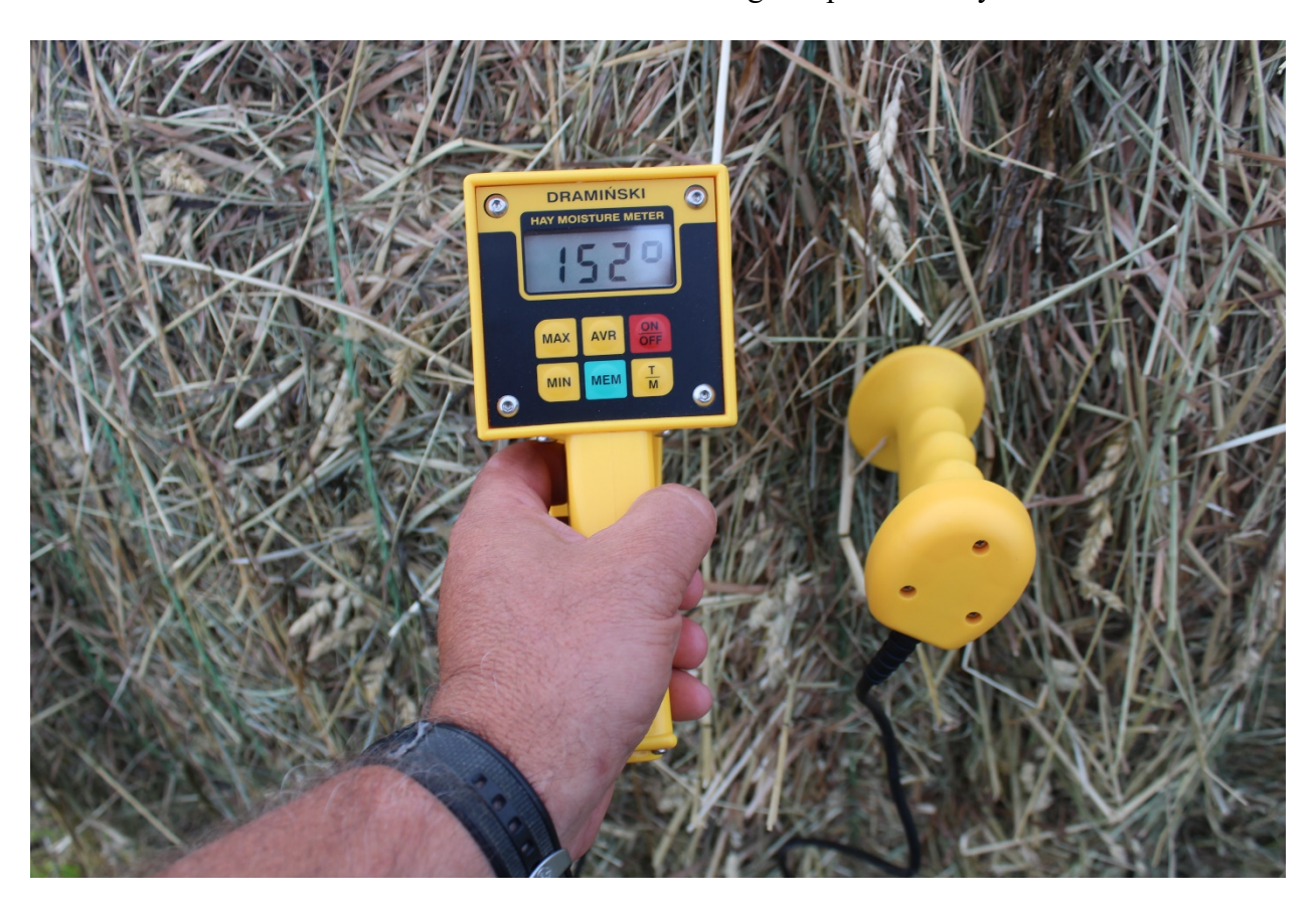
Figure 2. This hay was baled above the 18-20% moisture range and has reached an internal temperature of more than 150 degrees Fahrenheit. Heating damages protein making it unavailable to the animal. If stored in a tightly packed hay barn, this bale could start a hay fire.

• Store under cover and off the ground. Protecting hay from weathering helps to reduce dry matter losses and maintain forage quality. Much of the weathering damage is a result of the hay bale wicking moisture up from the ground. So, storing hay off the ground on a stone pad can greatly reduce deterioration.