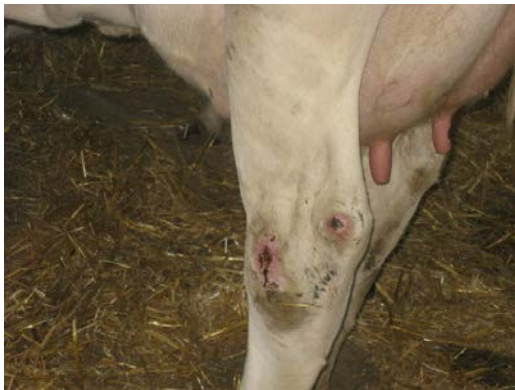
Figure 1. Hock injuries are common in tie-stalls with hard resting surfaces or inadequate bedding.