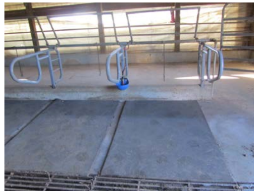
Figure 2. Insufficient bedding on top of tie-stalls is a common problem.