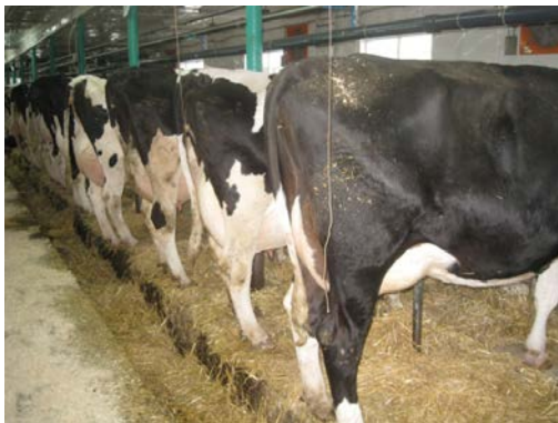
Figure 3. Simply adding more bedding to tie-stalls can have a dramatic impact on stall comfort and lying times.